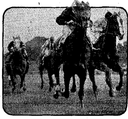
Omaha (right) challenging Bobsleigh for the lead in the Queen's Plate at Kempton Park.

The fact that it was a slowly run race spoilt the affair somewhat as an Ascot test, but it favoured one no more than the other.